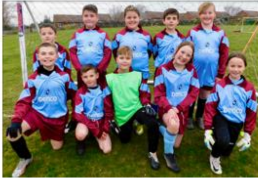
Heacham Hotshots Y5