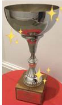
The Croydon Cup