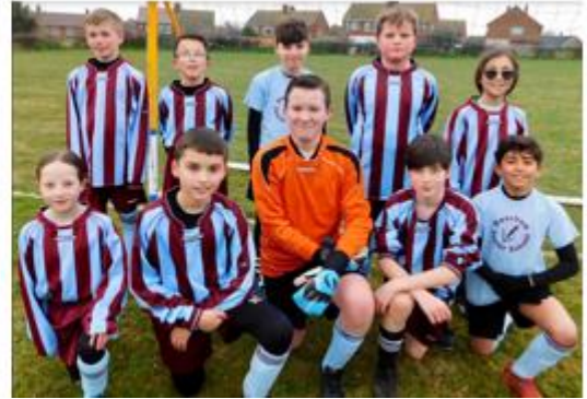
Heacham Hurricanes Y6