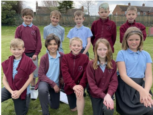
Heacham Sports Leaders

Many schools from the Smithdon Cluster took part in the Tri-Golf festival, which Heacham Junior hosted again. Some of our Y3/4 took part in the competition and our Sports Leaders helped run the event. There were a couple of medal winners too! Well done everyone, great sportsmanship all round!