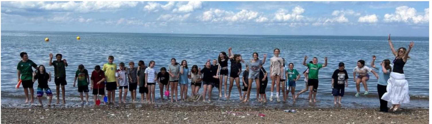
Year 6 Leavers 2025

Love of learning, bright futures, happy memories!